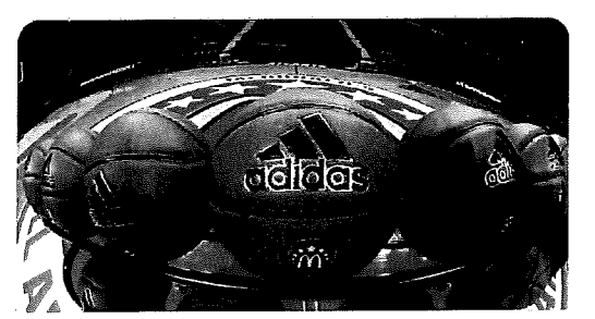
College basketball corruption trial: Ex-Adidas exec sentenced to nine months in ... & cbssports.com