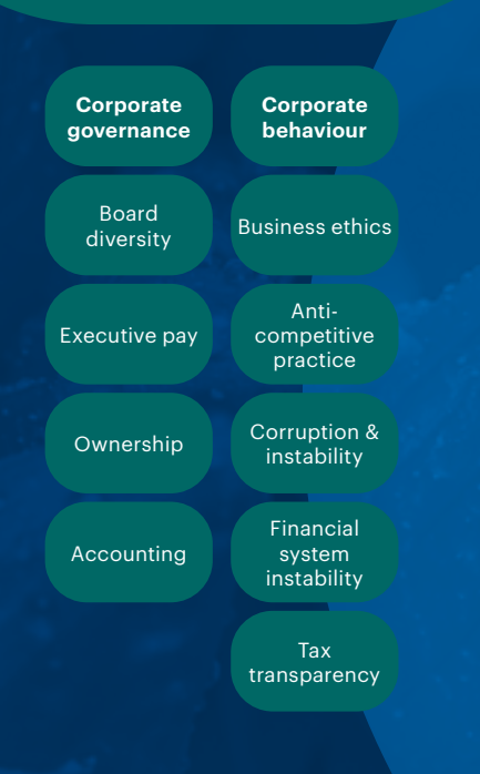
Figure 1 (continued)

Governance refers to themes surrounding corporate governance and behaviour, including ethics, corruption, transparency, response to sanctions, political contributions, anti-competitive practices, human rights abuses and corporate sustainability.