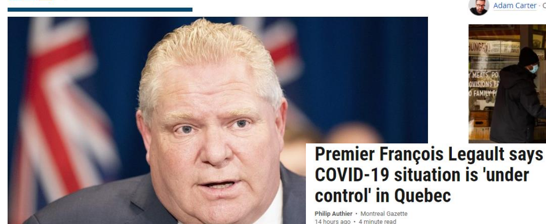
"Ford government to unveil plans to reopen Ontario's economy", Canadian Press, 27 Apr. 2020, <a href="https://toronto.citynews.ca/2020/04/27/ontario-">https://toronto.citynews.ca/2020/04/27/ontario-</a> quebec-reopening-plan-coronavirus>