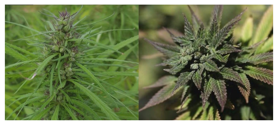
Hemp (not > .3% THC) "Marijuana"

+ Extracts from glands on flowers & leaves containing cannabinoids, terpenes and flavonoids