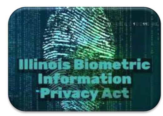
Biometric bills on the rise. BIPA in IL heavily litigated tool