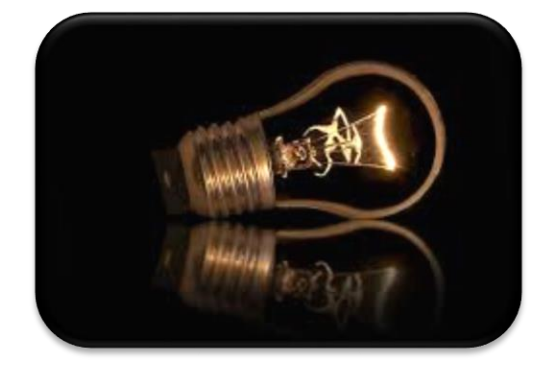
Additionally active bills in CT, AK, NJ