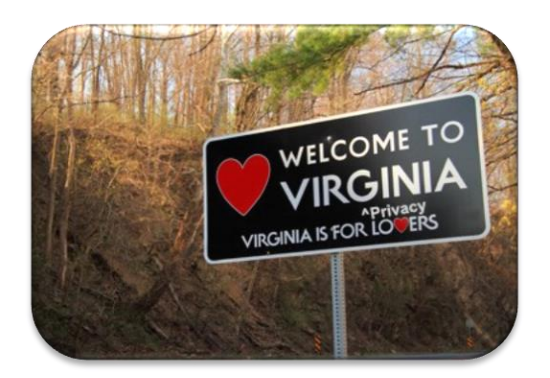
2021 Virginia Consumer Data Protection Act