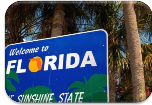
Florida considering the Florida Privacy Protection Act