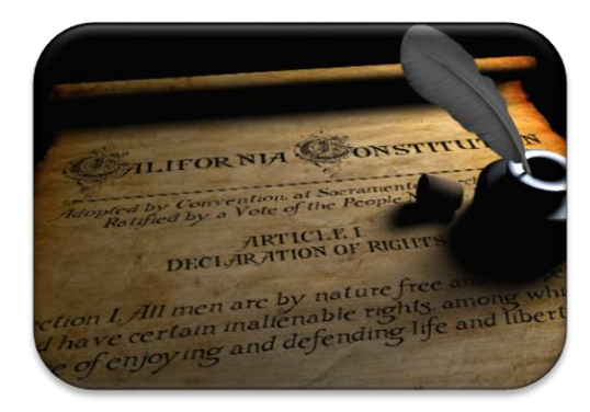
1971 Californian voters amended Constitution to add right of privacy