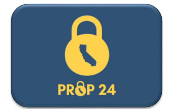
2020 California Consumer Privacy Rights Act (CPRA)