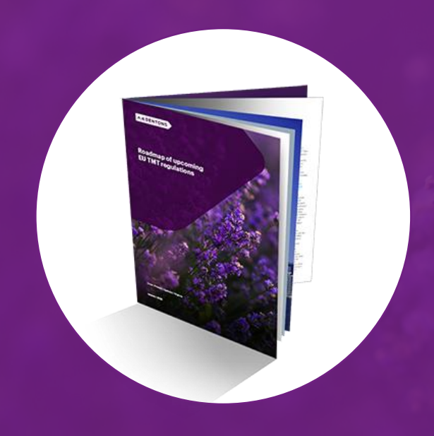
Check out our guide!